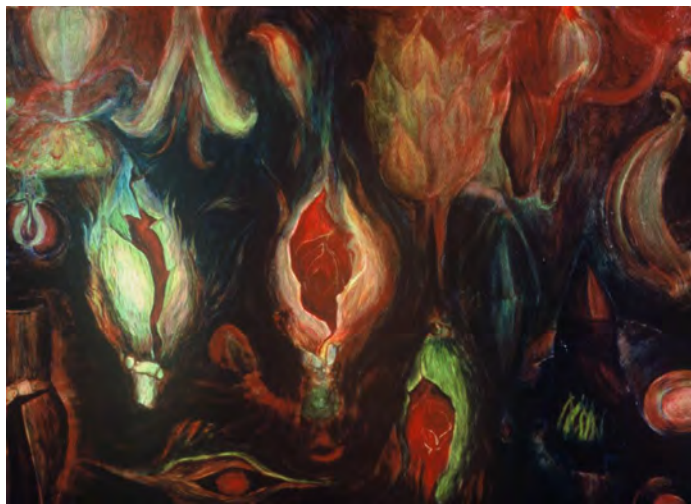
Title: Assorted Buds