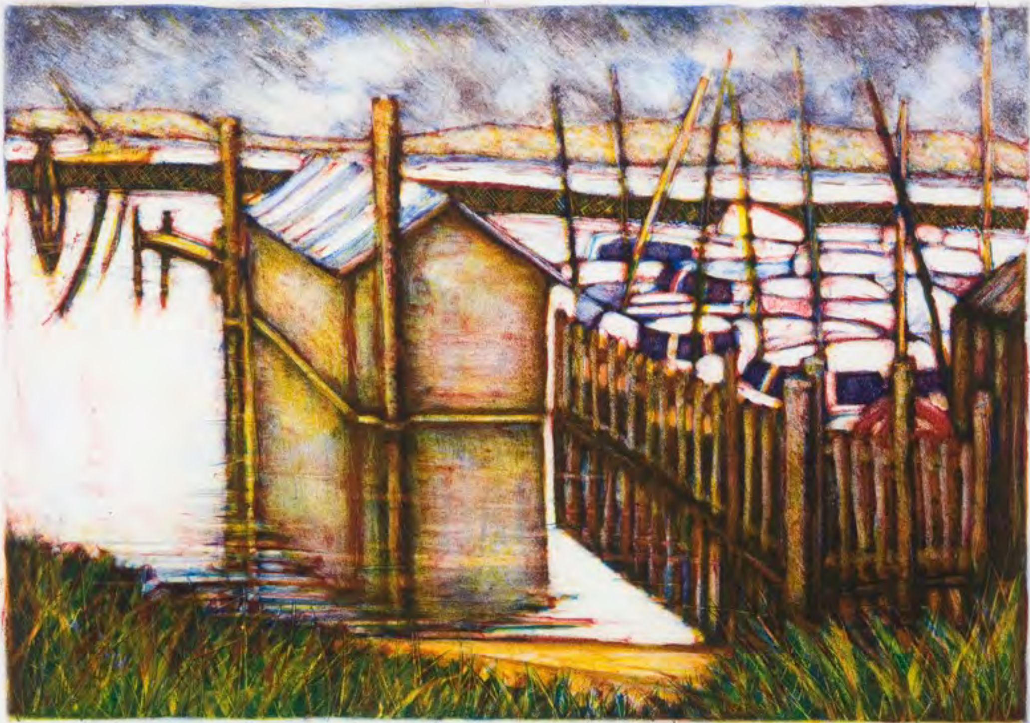
Calcutta before the storm