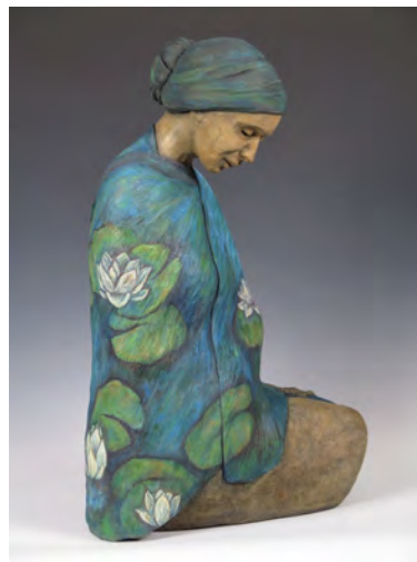
River of Grace