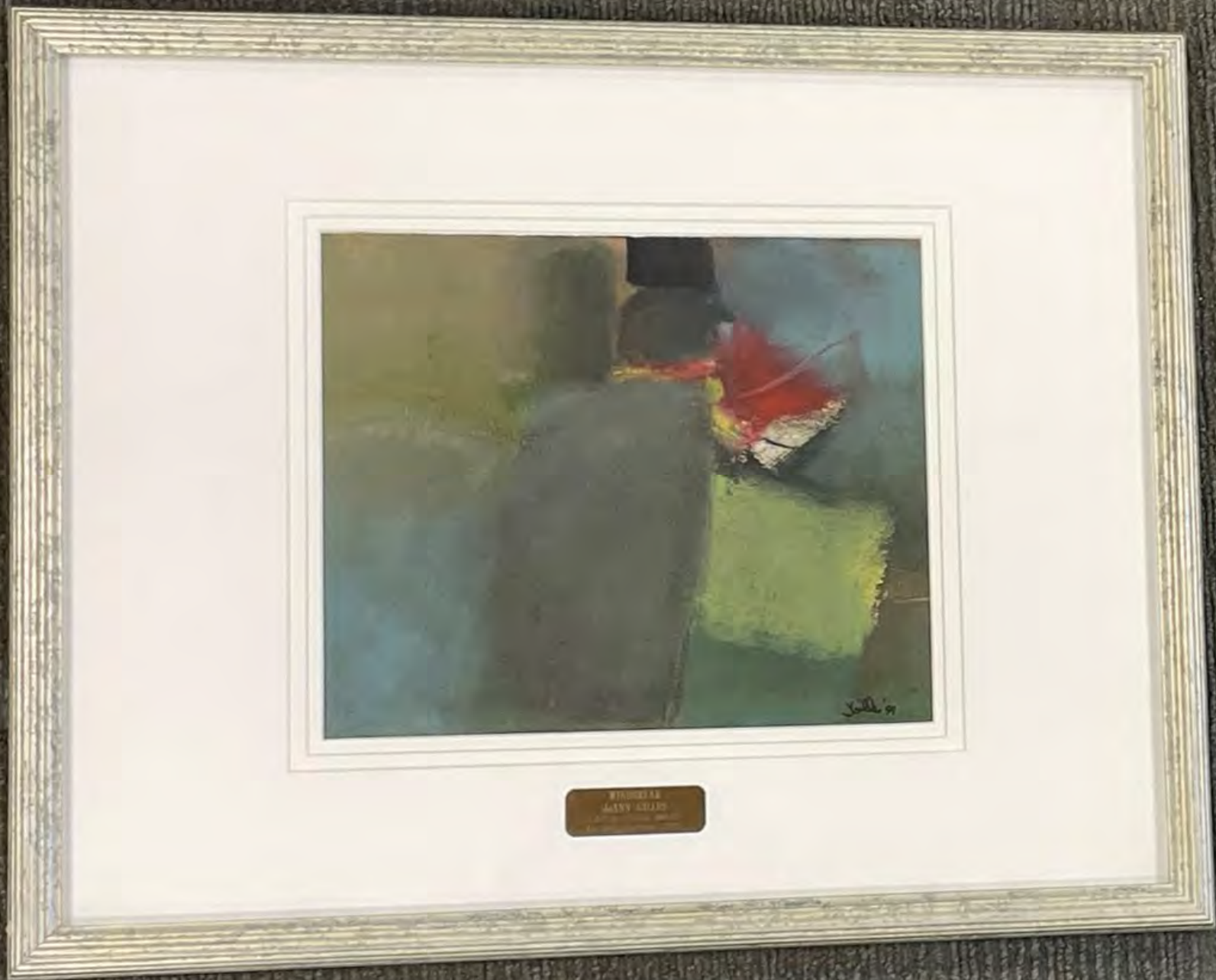
WILLIAM DE Kooning Abstract (1950) Oil on canvas, 10 1/2 x 14 1/2 inches Art Collection, New York